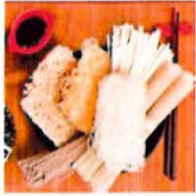
ASIAN (78 ITEMS)