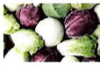
X - CABBAGE (10 ITEMS)