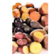
X - POTATOES (34 ITEMS)