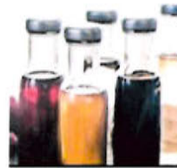
VINEGAR (44 ITEMS)