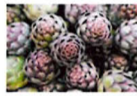
X - ARTICOKES (8 ITEMS)