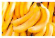
X - BANANAS (7 ITEMS)