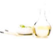
VINEGAR ASIAN (1 ITEMS)