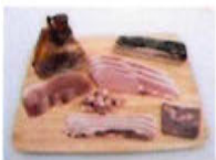
MEAT PORK (53 ITEMS)