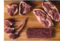
MEAT LAMB/VEAL (14 ITEMS)