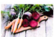
X - ROOT VEG (14 ITEMS)