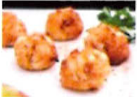
HORS D'OEUVRES (16 ITEMS)