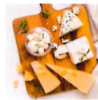
CHEESE VERMONT (25 ITEMS)