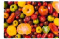
X - TOMATOES (20 ITEMS)