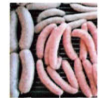
MEAT SAUS GAME (22 ITEMS)