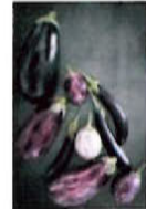
X - EGGPLANT (3 ITEMS)