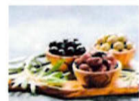
OLIVES (97 ITEMS)