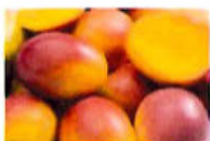
X - MANGOES (4 ITEMS)