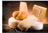
CHEESE ITALY (25 ITEMS)