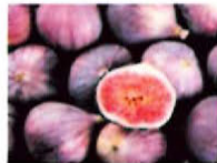
X - FIGS (1 ITEMS)