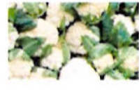
X - CAULIFLOWER (8 ITEMS)