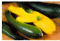
X - SQUASH (16 ITEMS)