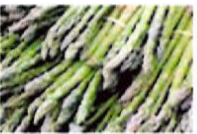
X - ASPARACUS (6 ITEMS)