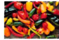
X - PEPPERS (21 ITEMS)