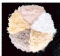
PASTRY/BAKING (50 ITEMS)