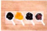
FRUIT DRY (25 ITEMS)