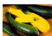
X - SQUASH (16 ITEMS)