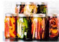
VEC PRESERVED (148 ITEMS)