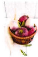
X - RADISHES (9 ITEMS)