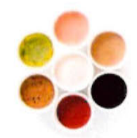
DEMI/BASE (16 ITEMS)