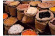
GRAIN (15 ITEMS)