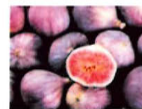
X - FIGS (1 ITEMS)