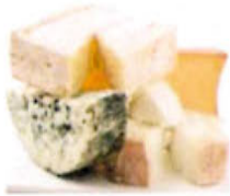
CHEESE FRANCE (9 ITEMS)