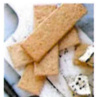
CRACKERS (50 ITEMS)