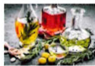
OILS (31 ITEMS)