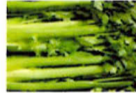
X - CELERY (5 ITEMS)