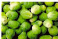
X - BRUSSEL SPP (4 ITEMS)