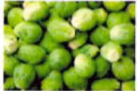
X - BRUSSEL SPR (4 ITEMS)