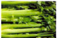
X - CELERY (5 ITEMS)