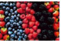
X - BERRIES (12 ITEMS)