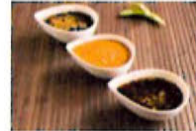
SAUCE ASIAN (2 ITEMS)