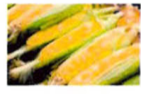
X - CORN (3 ITEMS)