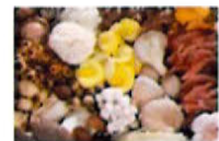
X - MUSHROOMS (26 ITEMS)