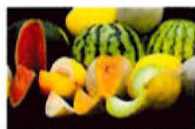
X - MELONS (15 ITEMS)