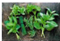
X - FRESH HERBS (29 ITEMS)