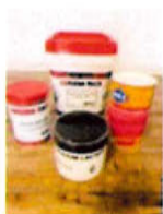
MOLECULAR (9 ITEMS)