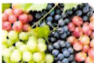
X - GRAPES (7 ITEMS)