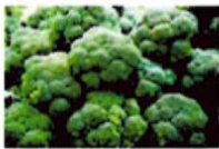
X - BROCCOLI (7 ITEMS)