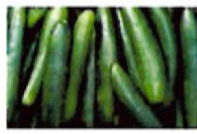
X - CUCUMBERS (5 ITEMS)