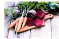
X - ROOT VEG (14 ITEMS)