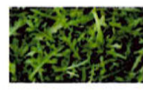
X - LEAFY GREEN (15 ITEMS)