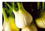
X - FENNEL (3 ITEMS)