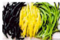
X - BEANS & PLA (14 ITEMS)