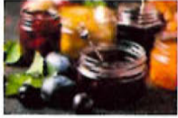
PRESERVE/HONEY (64 ITEMS)