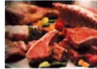
MEAT GAME (36 ITEMS)