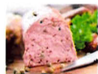
PATE (22 ITEMS)