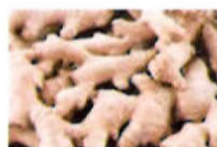
X - GINGER (2 ITEMS)