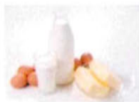
DAIRY/YOGURT (71 ITEMS)