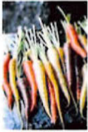
X - CARROTS (13 ITEMS)