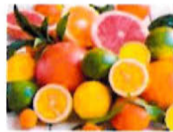
X - CITRUS (21 ITEMS)