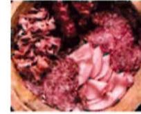
CHARCUTERIE (118 ITEMS)