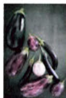
X - EGGPLANT (3 ITEMS)