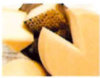
CHEESE SPAIN (20 ITEMS)