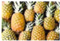
X - PINEAPPLE (6 ITEMS)