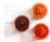
SAUCES (20 ITEMS)