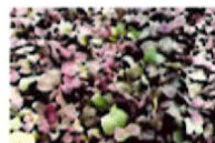
X - MICROGREENS (34 ITEMS)