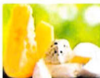
CHEESE USA (11 ITEMS)