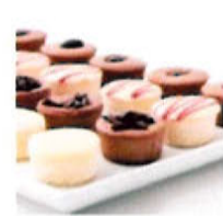
DESSERTS (10 ITEMS)