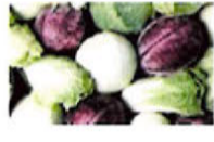
X - CABBAGE (10 ITEMS)