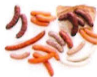
MEAT SAUSAGE (32 ITEMS)