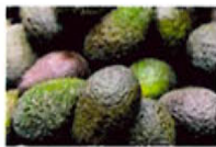
X - AVOCADO (6 ITEMS)