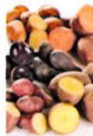
X - POTATOES (34 ITEMS)