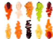
CONDIMENTS (54 ITEMS)