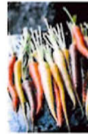
X - CARROTS (13 ITEMS)