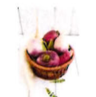
X - RADISHES (9 ITEMS)